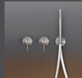
CEA THERMOSTATIC SET WITH DIVERTER