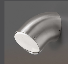
CEA SHOWER HEAD