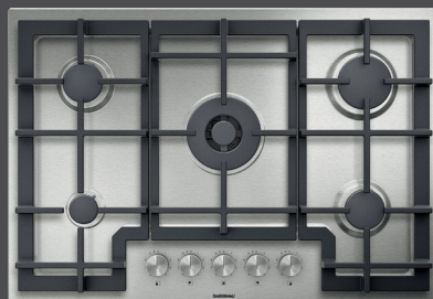
GAGGENAU GAS COOKTOP