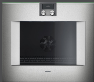
GAGGENAU INTEGRATED OVEN