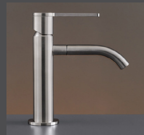
CEA SINGLE HOLE MIXER